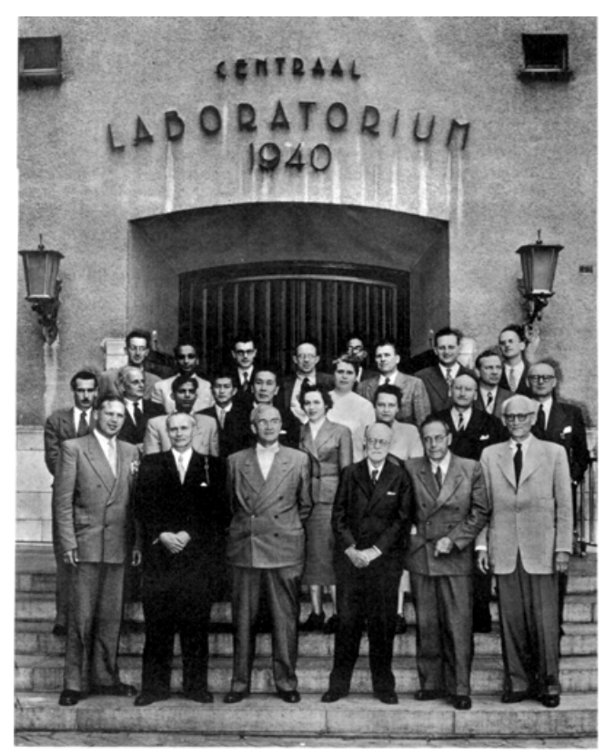
Figure 5. The first formal meeting of the International Committee for Coal Petrology held at Geleen in the Netherlands in 1953

particularly illustrating the different classifications which were then in existence and the probable correlations between them. Also, pointing to the future, was a section of the paper devoted to the classification of fossil organic matter - naphthabitumens, kerabitumens and caustobioliths, which included the sapropels and in the public session of the Nomenclature Commission there was a long discussion on this particular matter. Although a great deal had been achieved, Alpern's paper also indicated how much still needed to be done, even in the classification of 'hard coals' which then were the pre-occupation of many countries world-wide. In particular, but unsurprisingly, the paper dodged the question of the classification of brown coals, an important component of fossil fuels, but acknowledged by all as likely to be an intellectually challenging topic when tackled.