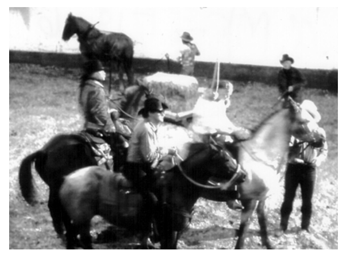
Figure 6. The Calgary 'hanging'

• And there this 'history' definitely ends! But not without all good wishes to the ICCP for its future.