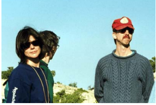
In 1994, which future TSOP president and vicepresident plot to gain these high positions? Answer page 31.