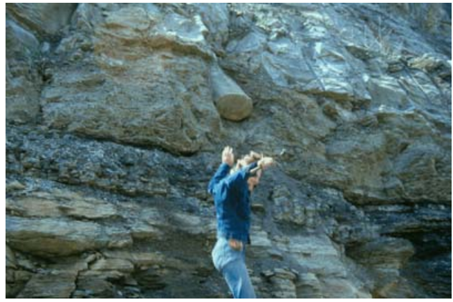
Whose 1983 safety motto was 'jump first, ask questions later'? Answer page 31. (Hint: see also KYCP #9)