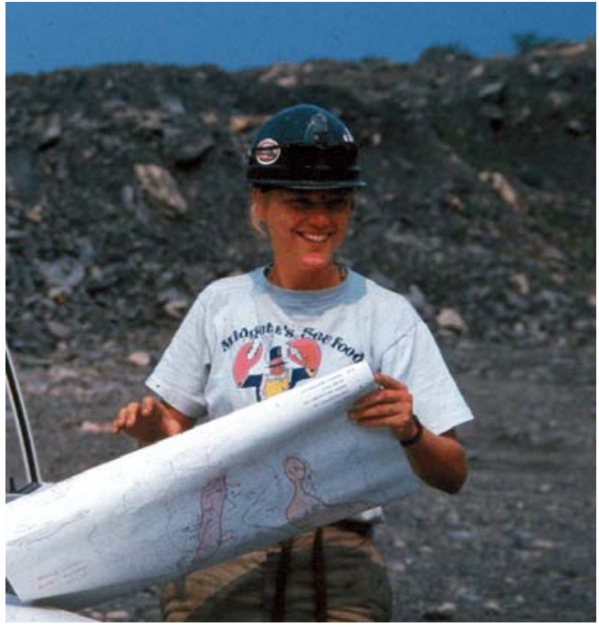
Name the candidate for ICCP 'safety officer' (see also KYCP #10) who, in about 1983, was attempting to look professional while wearing a "Midgett's Seafood" T-shirt emblazoned with a lobster. Answer page 31.