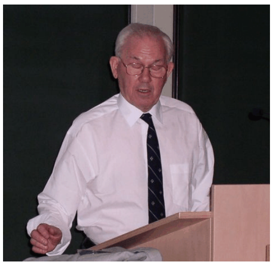
A familiar face to many of us, here at the Mackowsky Symposium in Utrecht in 2003, apparently able to give his presentation in his sleep. Answer page 26.